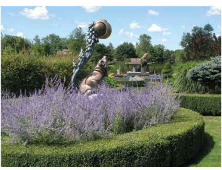
surrounded by pitch perfect greenery composed of more than 4,000 plants and trees, Moonlight Howls is a howling landscape success at tapper Gardens in the distance, sculptures Precious Carapa and Poetic Gestures , also by Jasonnapier, create ambiance within the landscape.

An artful space can be a powerful experience for the viewer, so be purposeful. "A sculpture garden creates an oasis that combines natural elements with art that touches